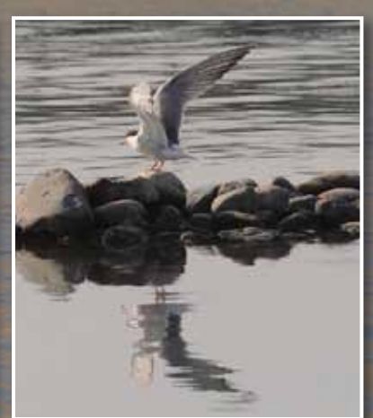
Oppostite page, top to bottom: Black birds flying over Pointe Mouillee, Russet-tipped Clubtail, Hylephila phyleus, Lake sturgeon, This page, background: Humbug Island, L to R: Osprey, Robin in winter, Common tern