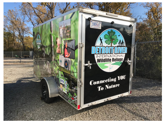
The recreation trailer is ready to bring outdoor recreation to community events.