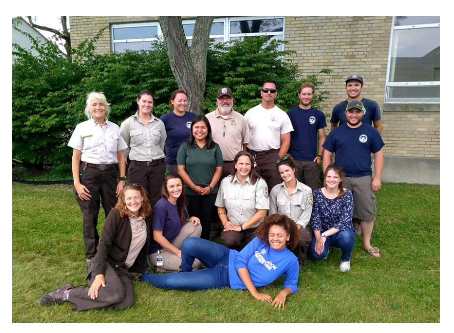
The 2019 DRIWR Staff looks forward to 2020!