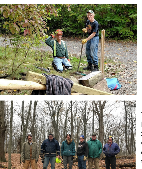
Volunteers perform trail maintenance at the Gibraltar Bay Unit. Photo: USFWS

The Humbug Marsh Stewardship Crew stands on a bridge they built on the Green Trail. Photo: USFWS