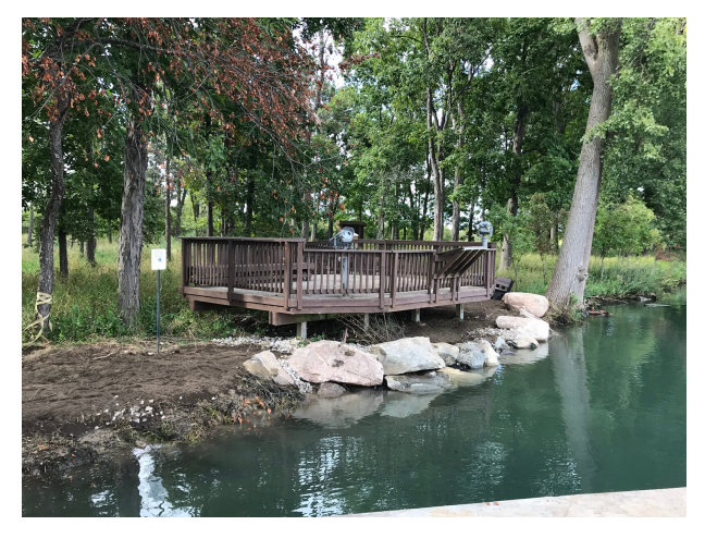
From top: Progress of the shoreline stabilization project at the Humbug observation deck before, during, and after completion.

Humbug Marsh, one of the cornerstone parcels of the Refuge and Michigan's only Wetland of International Importance, contains the last mile of undeveloped shoreline on the U.S. side of the Detroit River. It is also a gem for introducing our communities to the wonders of the great outdoors. Over the years, many partnerships added amenities to Humbug to make it easier for the public to enjoy the marsh, including kiosks, observation decks, boardwalks, and an education shelter. For the last few years, Lake Erie water levels reached record high levels not seen since the mid 1980's. The U.S. Army Corps of Engineers predict high water will remain for at least the next few years. These sustained water levels, combined with wind driven tides called seiches (which are very common on Lake Erie and the lower Detroit River) impacted natural shorelines, beach ridges, and diked wetlands, including the Humbug Marsh shoreline.