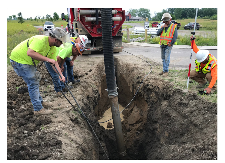
Contractors worked on the sewer lines throughout 2019 and finally fixed the "crap job".