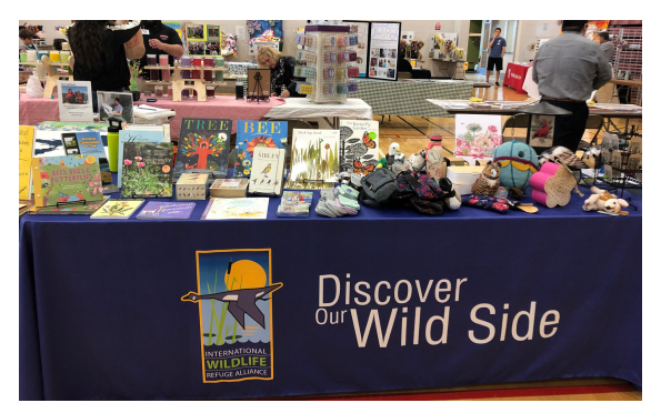
Traveling Nature Store at the Monroe Earth Day Expo in April 2019.

Product development was one of the most exciting tasks of 2019: Canvasback Corner will feature custom designed items including apparel, pins, magnets, and beautiful handmade ceramic mugs. Creating this merchandise was really fun and we cannot wait for visitors to see it on the shelves, and then hopefully wear and use the items with pride for Detroit River International Wildlife Refuge!