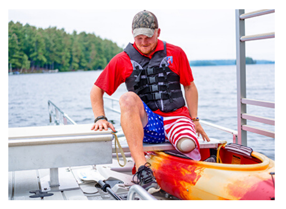
The accessible kayak launch will provide safe entry into Humbug Marsh for all visitors of the Refuge.

In July, IWRA had the pleasure of partnering with the DTE Energy Foundation and Colina Foundation to bring the Inland Seas Education Association schooner to Elizabeth Park for two fundraising sails. The family-focused educational sail focused on micro-plastics in the Great Lakes, and children were able to participate in hands-on sampling methods. Later that evening, adult guests enjoyed a catered dinner at the Chateau on the River before setting sail toward Humbug Marsh. As a special bonus, the afternoon sail was featured on the Downriver episode of the PBS show 'Under the Radar'.