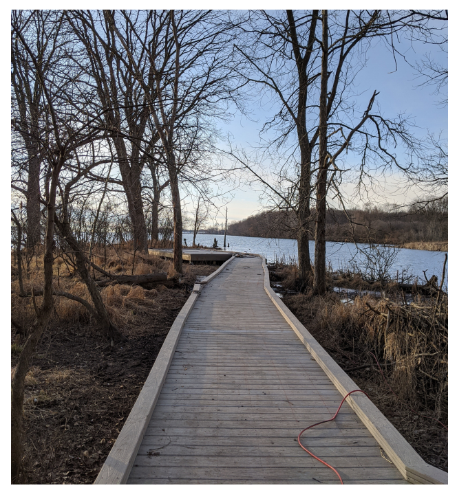
The nearly-completed boardwalk on the Orange Trail at Humbug Marsh.

Connecting urban neighborhoods to nature and recreation opportunities is a national priority!