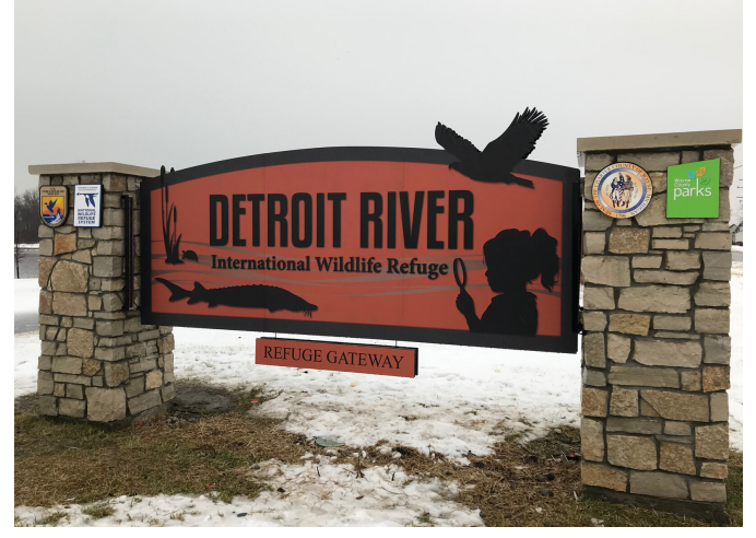
The sign at the Refuge Gateway was installed in the winter and looks great!

"The refuge started as just an idea, and to see the hundreds and now thousands of acres of preserved land and wetlands is amazing. It's such an important part of the ecology for migratory birds and other species, and it is right here in our backyard." - John D. Dingell Jr.