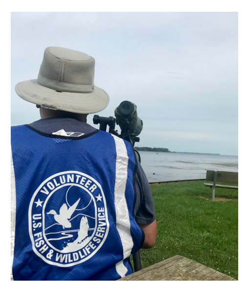
Detroit River Hawkwatch volunteers were on site at Lake Erie Metropark every day from September through November.