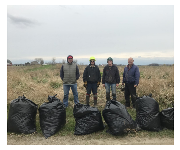
Stewardship Crew volunteers pose with bagged invasive plants that they removed from Refuge habitat.