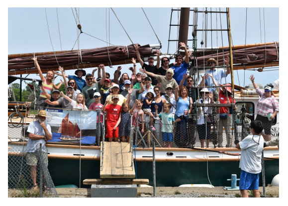
Families, ISEA crew, UTR crew, and IWRA staff had a great time on the afternoon sail!